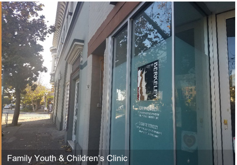
Family Youth & Children's Clinic